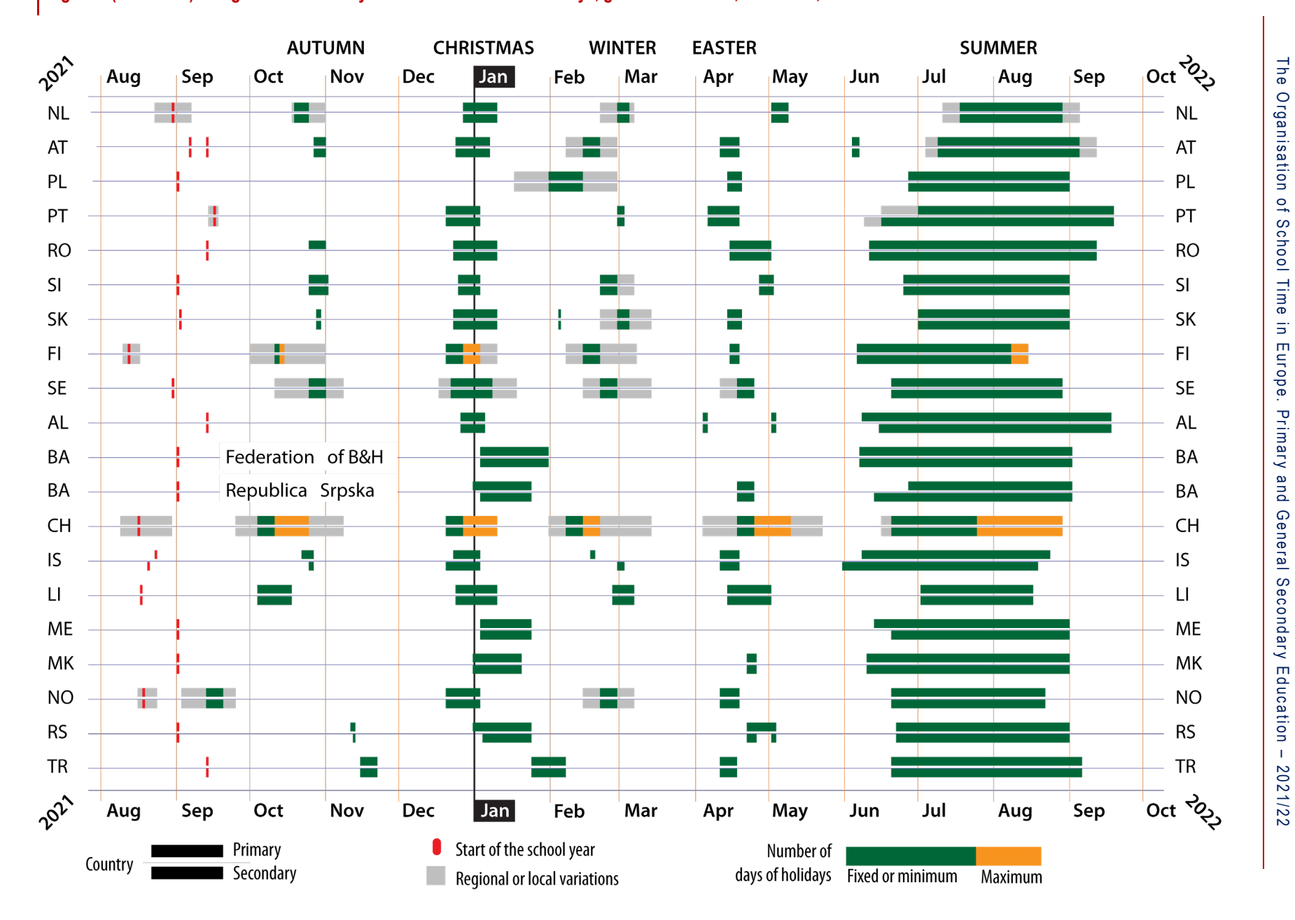
Figure 1 (continued): Length of the school year and distribution of holidays, general education, ISCED 1-3, 2020/21

NB: Denmark, Latvia, Hungary, Slovenia, Sweden and Serbia: The distinction is made between primary and lower secondary education (single structure) on one hand and upper secondary on the other hand.